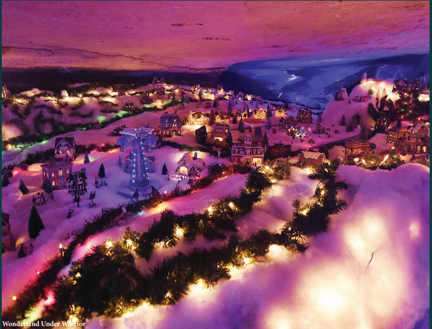
Wonderland Under Warrior