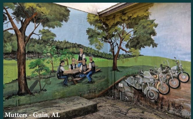
Mutters - Guin, AL