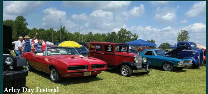
Arley Day Festival