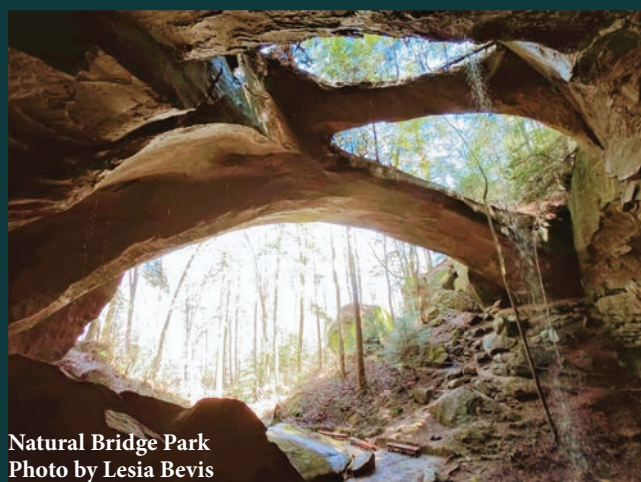
Natural Bridge Park