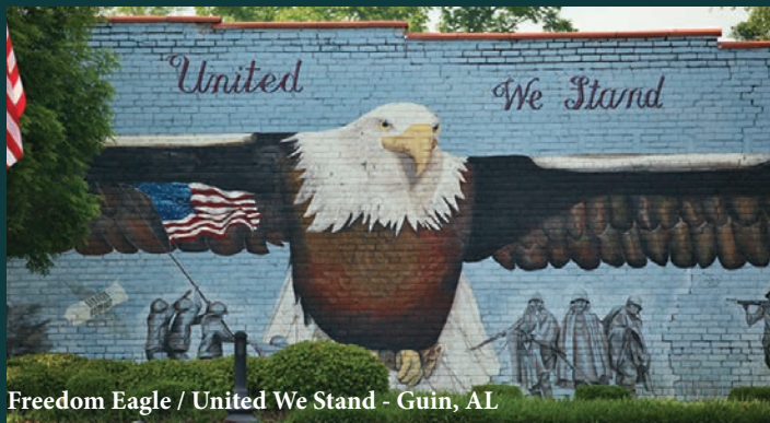
Freedom Eagle / United We Stand - Guin, AL