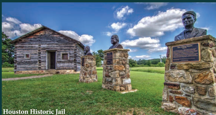
Houston Historic Jail