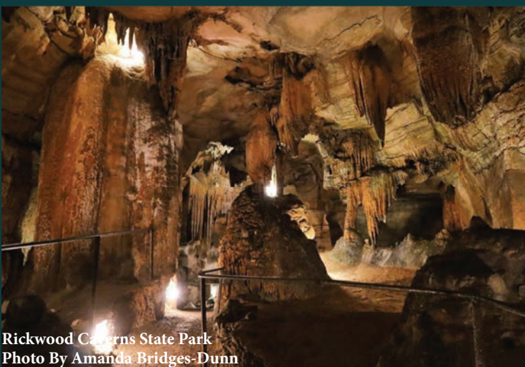
Rickwood Caverns State Park