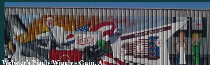
Webster's Piggly Wiggly - Guin, AL