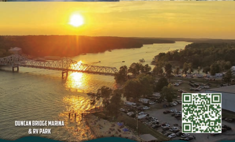
DUNCAN BRIDGE MARINA & RV PARK