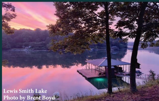
Lewis Smith Lake