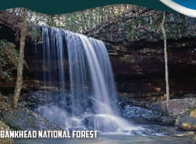
BANKHEAD NATIONAL FOREST